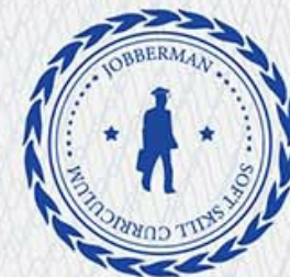
Head, Youth Engagement and Learning Jobberman Nigeria